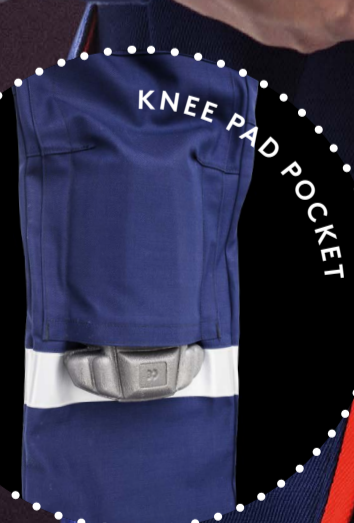
KNEE PAD POCKET