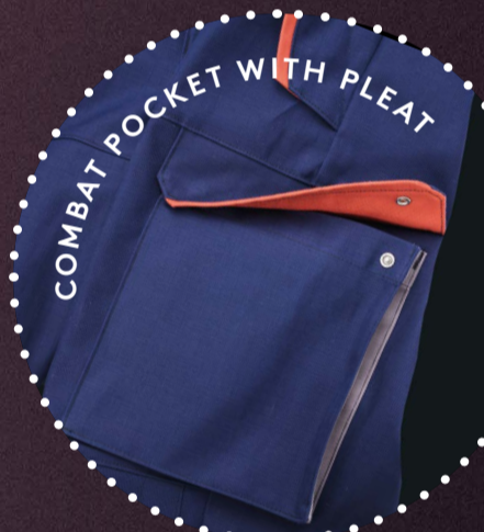
COMBAT POCKET WITH PLEAT