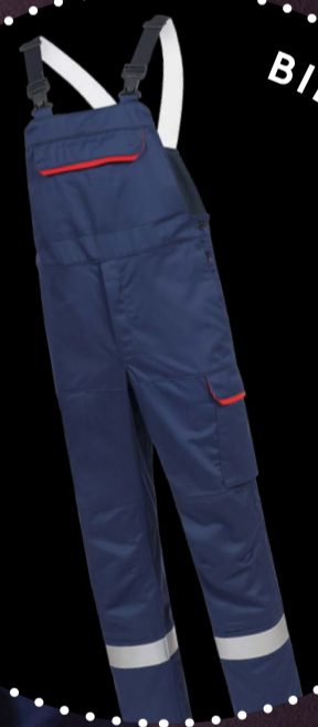
BIB AND BRACE TROUSERS