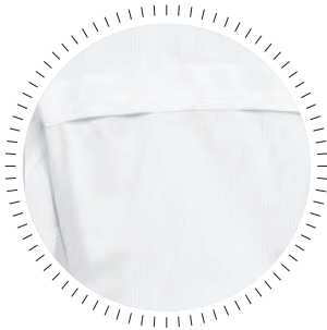
Ventilation on the back

HABETEX® ESD Comfort is the perfect solution for prevention of both electric charging and high particle release. The fabric combines ESD and cleanroom features. So this is multifunctional clothing for working areas needing both ESD and cleanroom protective properties. Fabric with quality label "breathability" from Hohenstein certification institute.