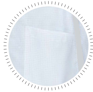
Attached side pockets with slanted opening