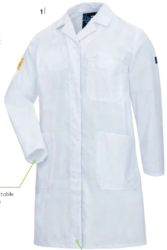
Sleeve hem adjustable via snap fasteners