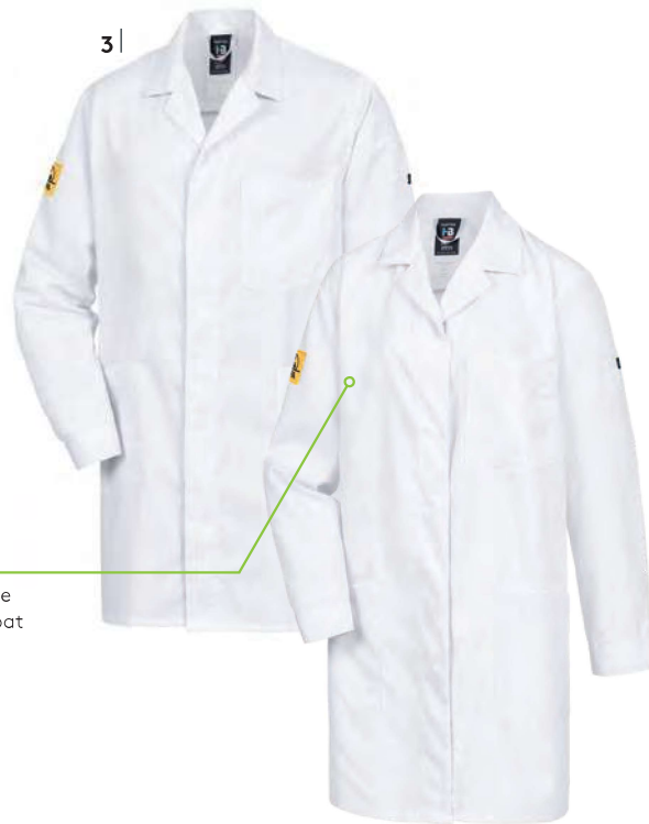
Darts on the women's coat