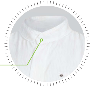
Stand-up collar with slanted corner