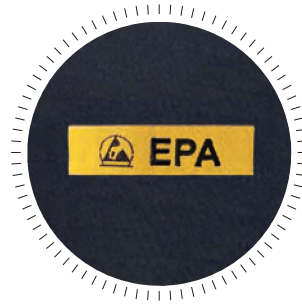
EPA emblem on right upper arm

For best possible protection while manufacturing electronic parts, CONDUCTEX® thread is entwined of two high quality carbon fibres.